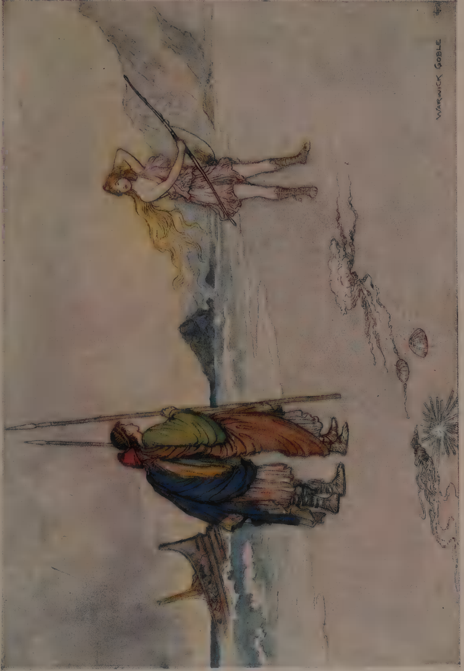
ÆNEAS AND ACHATES MEETING VENUS